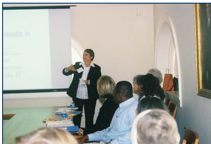
2006 Conference Session

in rural vs. urban populations, education of health care professionals on diversity issues, managing diabetes with rural African Americans, preventing sexually transmitted infections and intimate partner violence in rural women, racial and ethnic disparities in rural mental health care, and meeting the mental health needs of Hispanic populations.